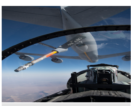
View From an F-15D