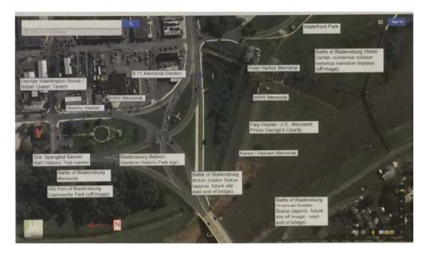
(Supp. J.A. 2)<sup>23</sup>