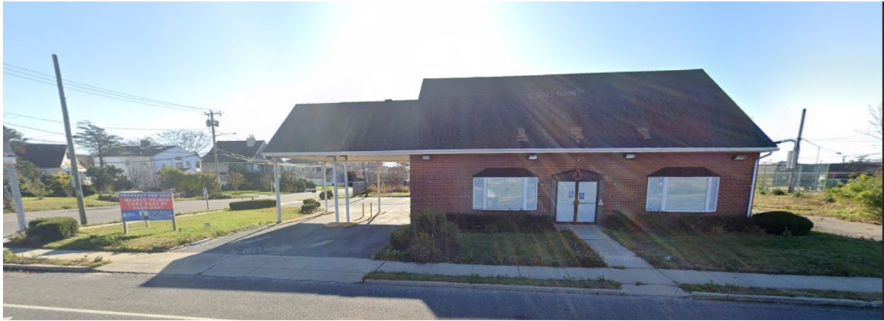
Figure 2 – Undeveloped Parking Lots on Ocean Blvd.